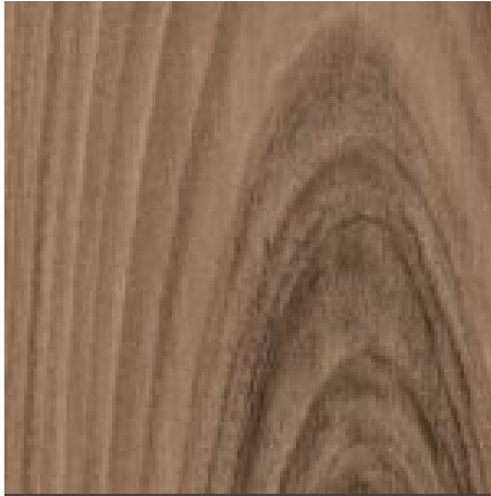
Bioselect Walnut Cinnamon