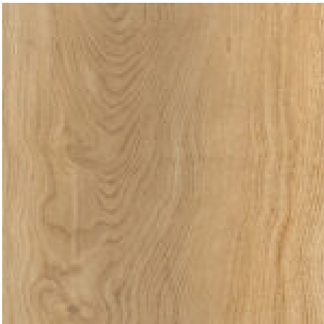
Bioselect Oak Natural