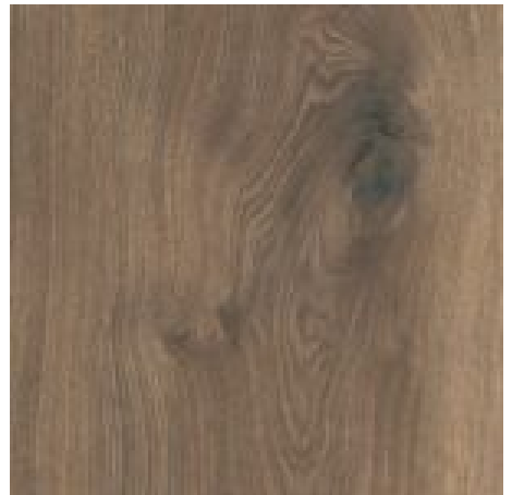
Bioselect Oak Cloves