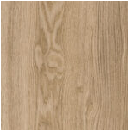
Bioselect Oak Ginger