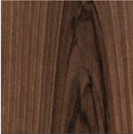
Bioselect Walnut Tabacco