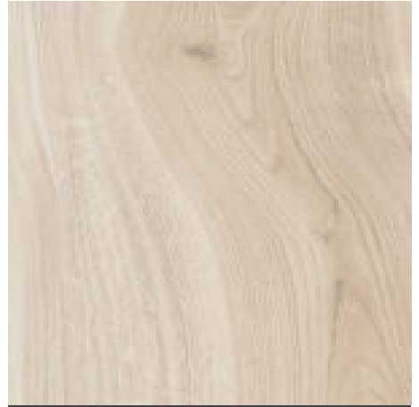
Bioselect Oak Vanilla