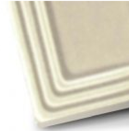
Epoque Ivory Matt