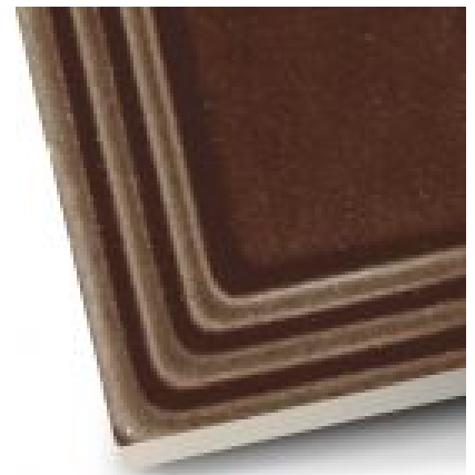
Epoque Caramel Craquelle