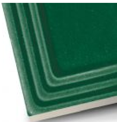
Epoque Bottle Craquelle