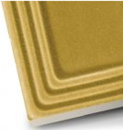
Epoque Mustard Craquelle