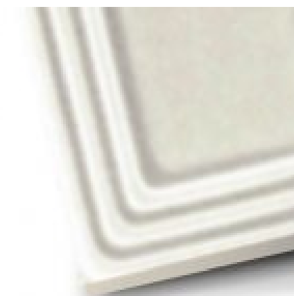
Epoque Bianco Matt