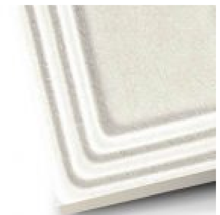
Epoque Bianco Craquelle