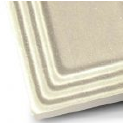
Epoque Ivory Craquelle