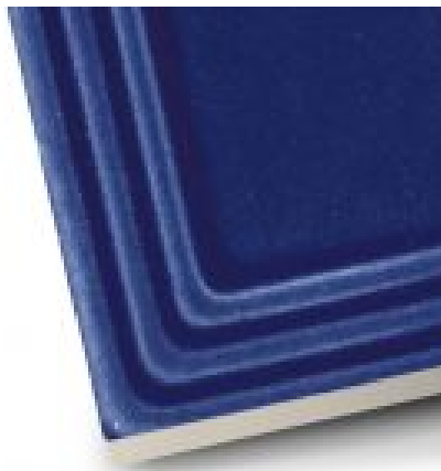
Epoque Cobalt Craquelle