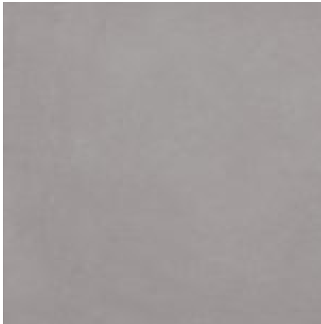
Metropolis Shanghai Iron