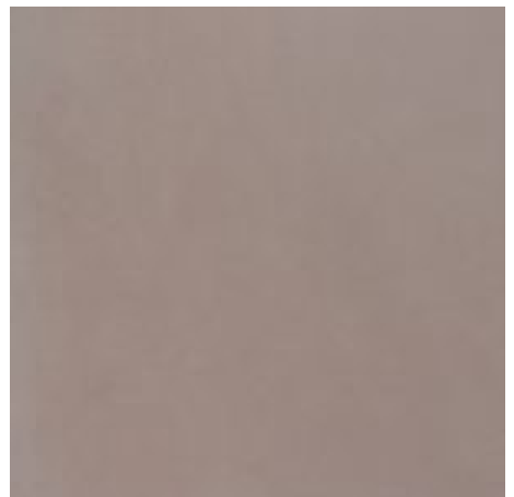
Metropolis Milan Ecu