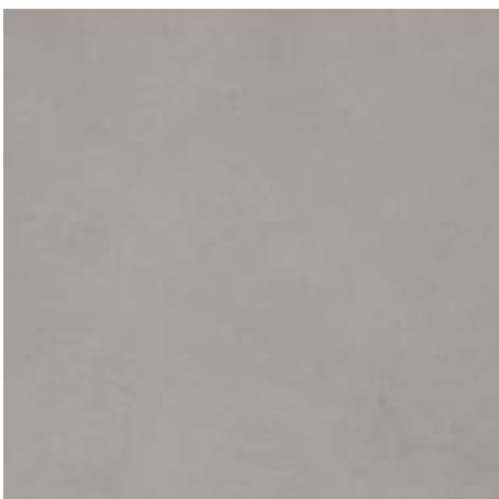
Metropolis London Grey