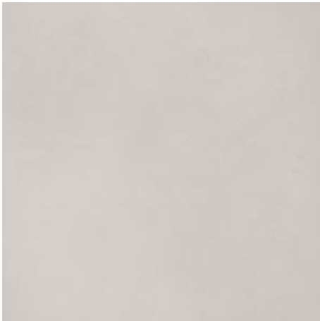
Metropolis Tokyo White