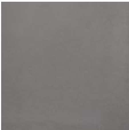
Metropolis New York Coal