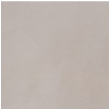
Metropolis Paris Amande