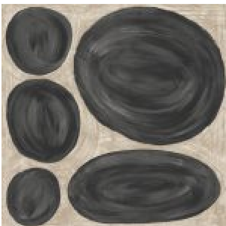
Manifesto Liquirizia Positive