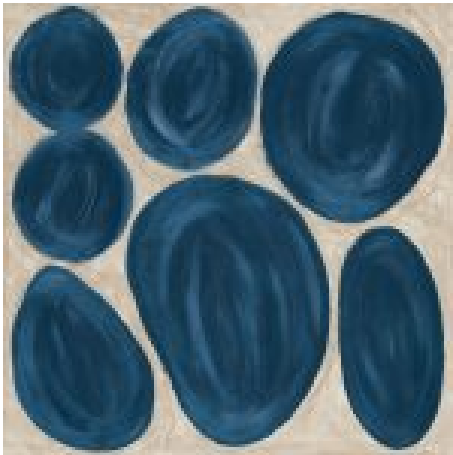
Manifesto Uva Positive