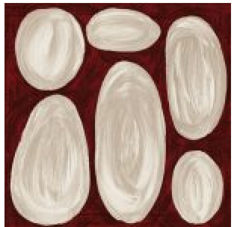
Manifesto Marsala Negative