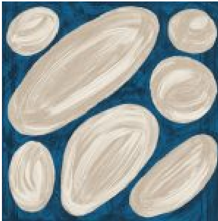
Manifesto Uva Negative