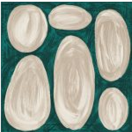
Manifesto Menta Negative