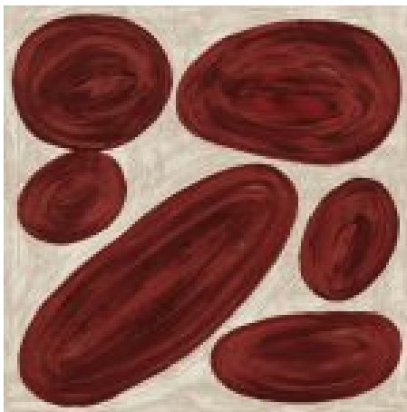
Manifesto Marsala Positive