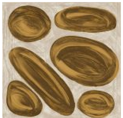
Manifesto Cedro Positive