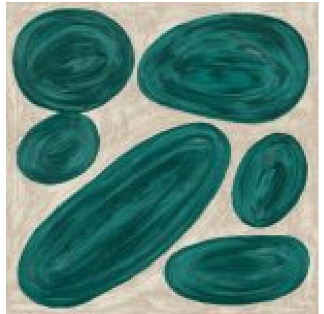
Manifesto Menta Positive