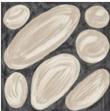
Manifesto Liquirizia Negative