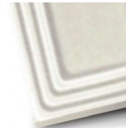
Epoque Bianco Matt