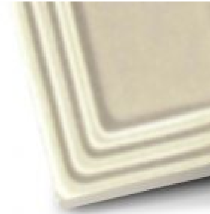
Epoque Ivory Matt