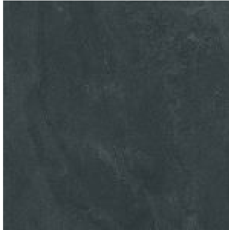
Core Shade Sharp