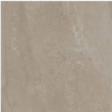
Core Shade Fawn