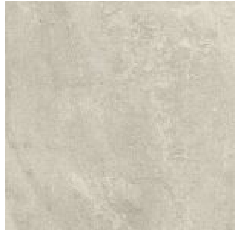
Core Shade Plain