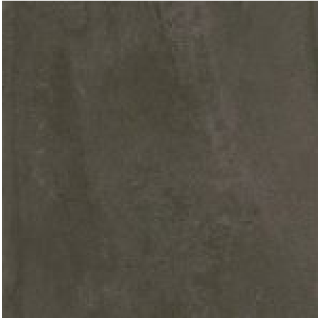
Core Shade Snug