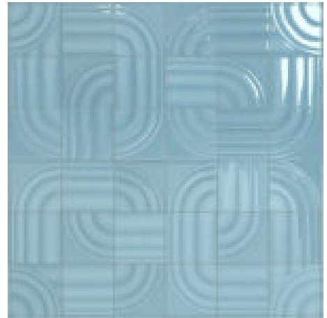
Circle Line - Interlink Button