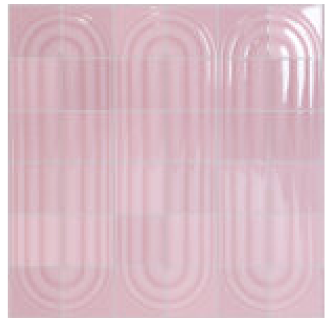
Circle Line - Deco Fingers