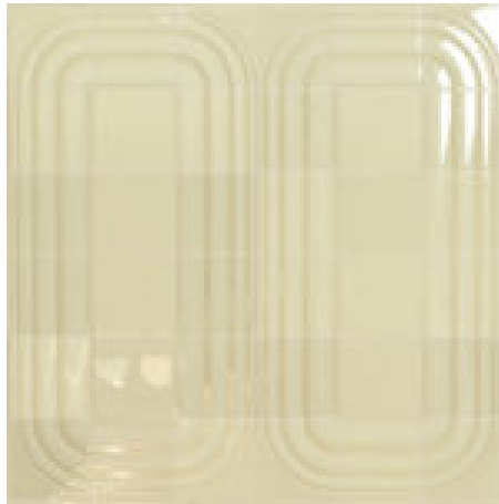
Circle Line - Loop