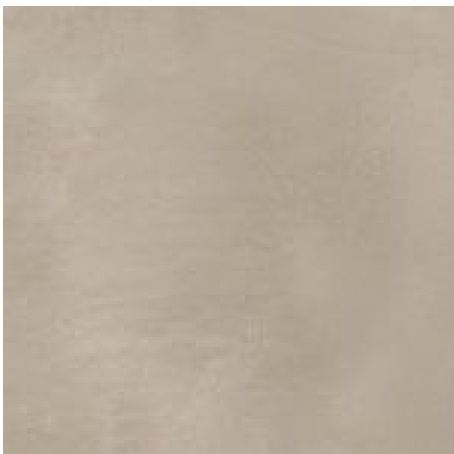
Blend Sand Concrete