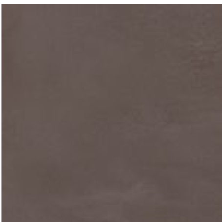
Blend Brown Concrete