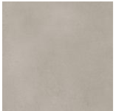
Blend Grey Concrete