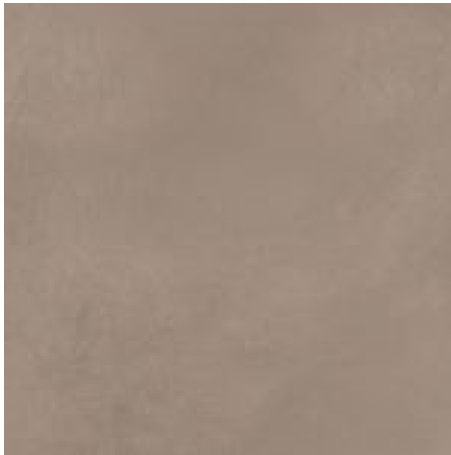
Blend Taupe Concrete