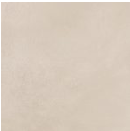
Blend Ivory Concrete