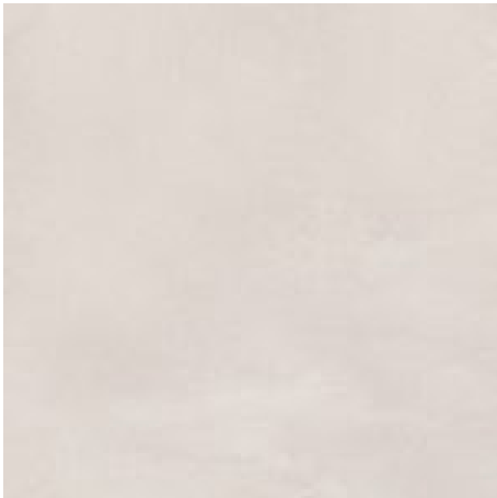
Blend White Concrete