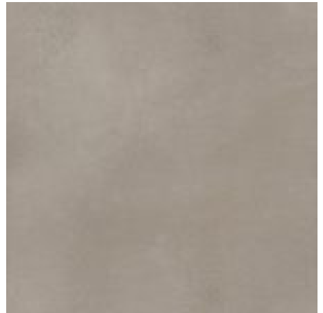
Blend Smoke Concrete